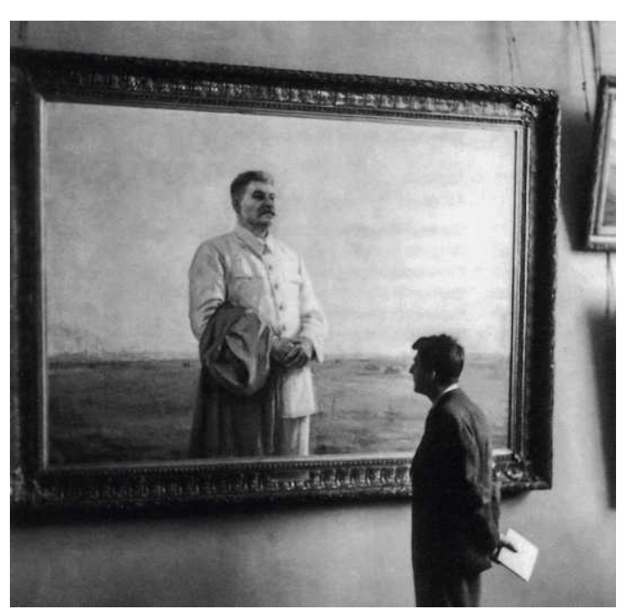
Aldo Rossi in Moscow, 1955