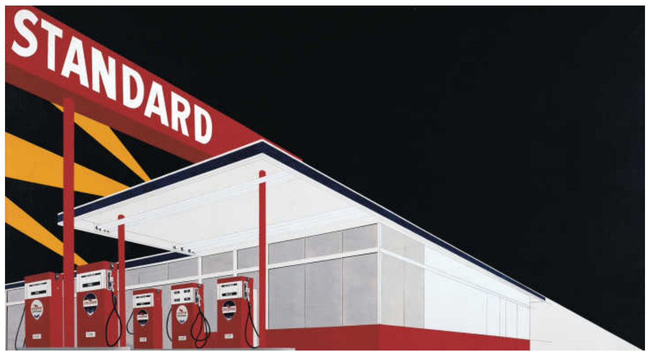
Ed Ruscha, Standard Station, Amarillo, Texas, 1963 / © Ed Ruscha. Courtesy of the artist and Gagosian.