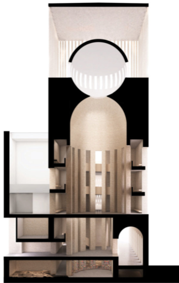
Concept elevation for House of One in Berlin, by Kuehn Malvezzi

We have been collecting art and working with artists on buildings, so our relations are manifold. I see in art not so much an addition to architecture as a tool and method to think about architecture. We have done many art and building projects where you can't disentangle the two. This is something that architects don't usually like to do, because it basically diminishes their role in many eyes. We have never thought about our role like this. We have always thought that the maximum experience is to come together with other arts. We think this is very contemporary once again because of the specialization that took place in the 20th century and the alienation of all the different fields of knowledge that need to be reassembled. And we have a good way forward with art and architecture.