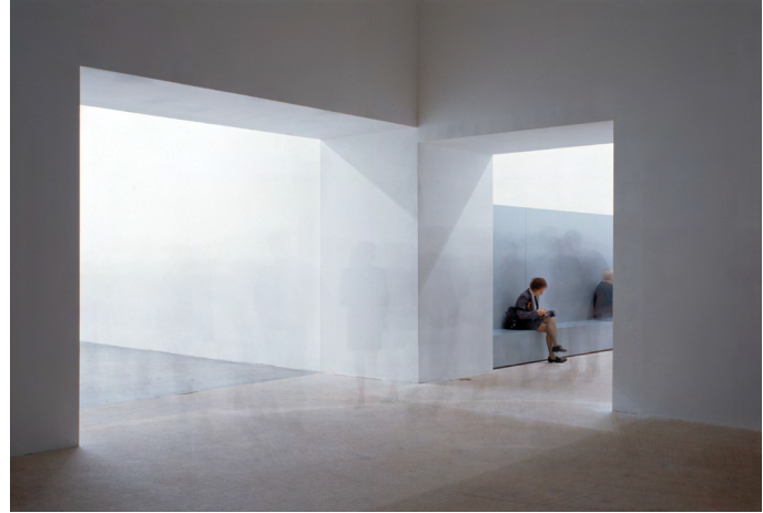
Kuehn Malvezzi, Documenta 11, Kassel, Germany, 2002. Intersection of exhibition spaces with bench.

Another project that Kuehn Malvezzi is currently involved with is the “House of One.” In terms of the process of planning and construction, can you see parallels to the Haas Haus situation? There, Hollein went on producing model studies even after he’d submitted the design.