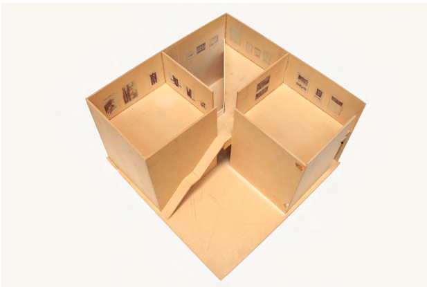
Hans Hollein, Abteiberg Municipal Museum, Mönchengladbach, Germany, 1972-1982. Working model of the so-called "cloverleaf principle" gallery spaces.

When Hollein was designing a building, he had a very strong perception of the space that was difficult to convey in plans at that stage. For this reason, working models and photos were important for his way of working.