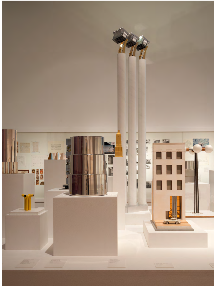
Kuehn Malvezzi, HOLLEIN, exhibition design, MAK, Vienna, Austria, 2014. View of installation including a scale model of the Feigen Gallery and the Kohlmarkt lamps.

who think mainly from the floor plan and who can't draw freehand. On the other hand you have Koolhaas, not known for his drawings, but whose Delirious New York is in line with Hollein's artistic and publishing work of the 1960s, reconnecting architecture to societal transformation at all levels and expressions.